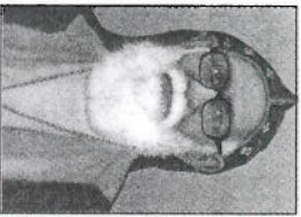
Yuhanon Mar Thoma