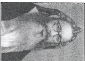
Mathews Mar Athanasius Episcopa